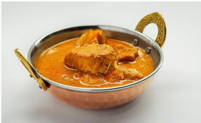
CHETTINAD CHICKEN MASALA