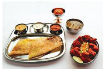
VEGGIE LIGHT MENU