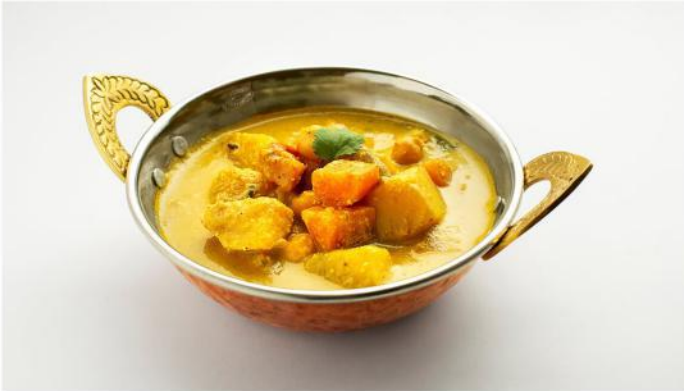
CHETTINAD VEG KURMA